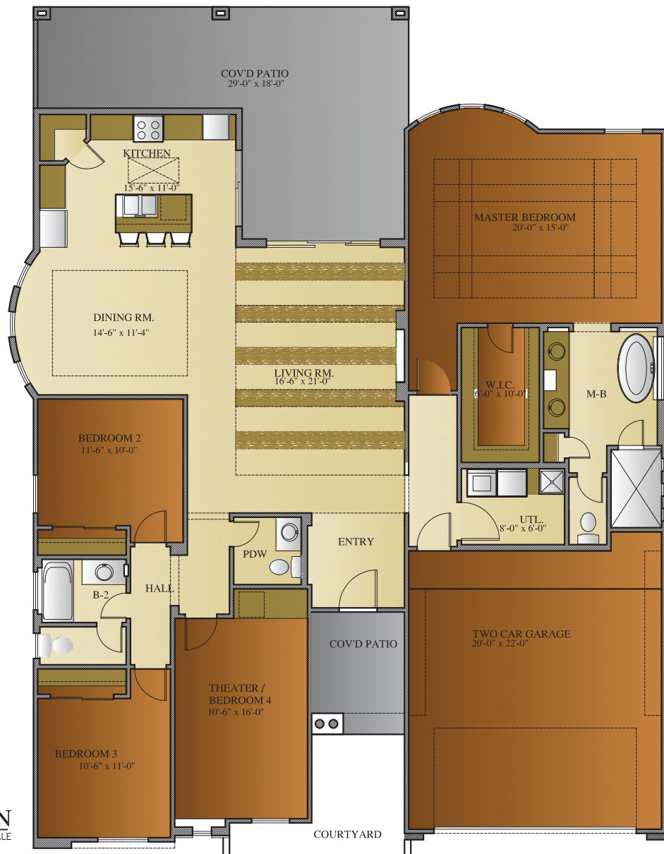
FLOOR PLAN NOT TO SCALE

BEDROOMS: 4 BATHS: 2 1/2 WIDTH: 50'-0" DEPTH: 55'-8"