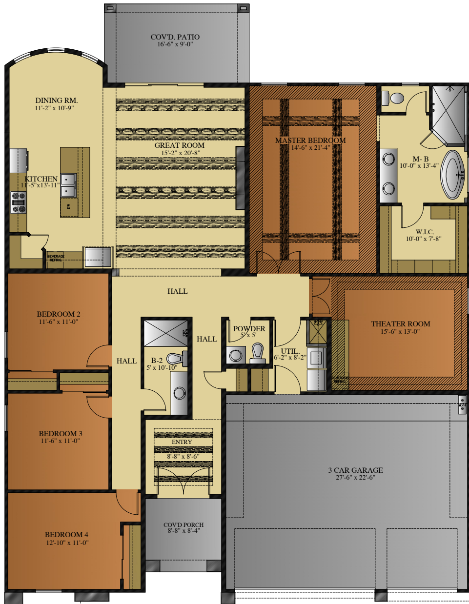
FLOOR PLAN NOT TO SCALE

NOTICE TO CONSUMER: All marketing materials are SOLELY for concept illustration purposes. All square footages are MERELY approximations. As we improve our product, BIC HOMES reserves the independent right to CHANGES WITHOUT NOTICE before closing, among other items, the following: Sales prices, buyer incentives, availability lists, floor plans, elevations, features & finishes, specifications, materials, product brands, processes, completion dates, option/selection cut off dates, window and door styles, rock walls, gate and driveway locations, garage orientations, ceiling heights, colors, landscaping. HOA fees and lot premiums may apply in certain communities. All agreements must be in writing. Please read your purchase agreement for warranty information and construction standards. Rev. 9-4-2020