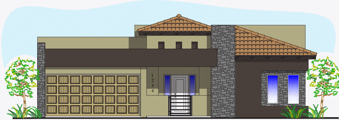
FRONT ELEVATION NOT TO SCALE