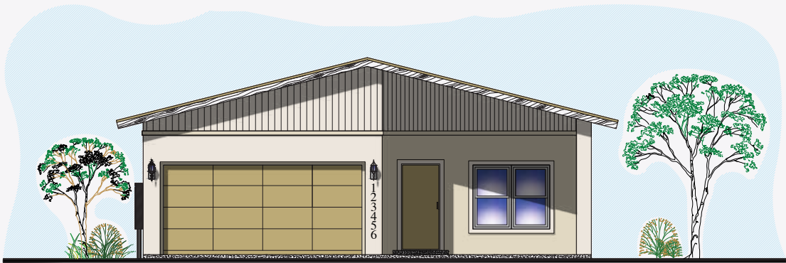
FRONT ELEVATION NOT TO SCALE

Introducing the Waco floorplan, boasting 1,501 square feet of luxurious living space. This stunning property features 4 bedrooms and 2 bathrooms, offering ample room for family and guests. Step onto the welcoming porch and enter the open floor plan, where a spacious kitchen, dining room, and family room await.