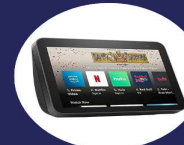
ECHO OR ALEXA SHOW