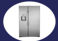
SIDE BY SIDE STAINLESS STEEL REFRIGERATOR