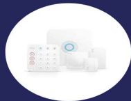
RING ALARM SYSTEM