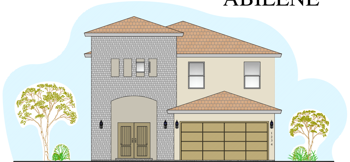
FRONT ELEVATION NOT TO SCALE